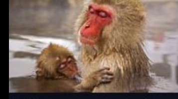
Nature Life 10. Primates