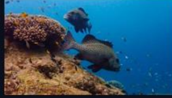
Nature Blue Planet Revisited Series 1: 2. Great Barrier Reef