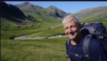
Nature The Lakes with Paul Rose Series 1: 4. Eskdale