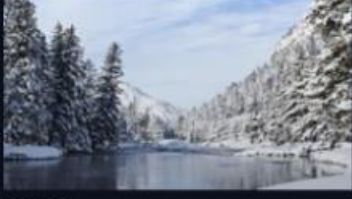
Nature Earth's Great Rivers Series 1: 3. Mississippi