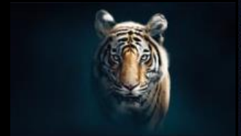
Science & Nature Dynasties Series 1: 5. Tiger