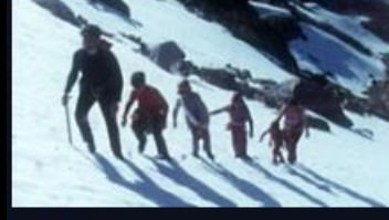
Lifestyle Breathing Space To the Land Where Glaciers Grow