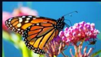
Nature Earth's Seasonal Secrets 4. Spring