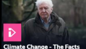
Climate Change - The Facts David Attenborough explores the science of, and potential solutions to, climate change.