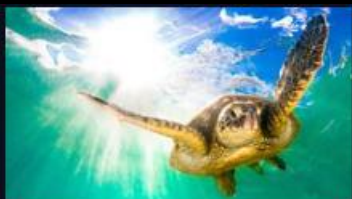
Nature Earth's Tropical Islands Series 1: 3. Hawaii