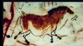
Nature Life on Earth 13. The Compulsive Communicators