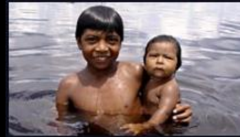
Science & Nature Equator 3. Latin America