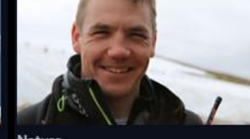
Nature The Mountain Series 1: Episode 6