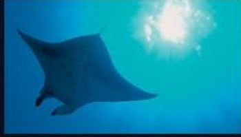
Nature The Blue Planet Making Waves