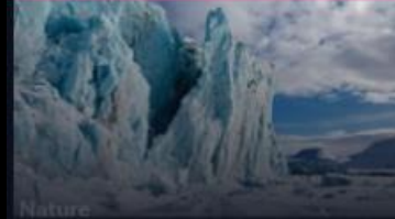
Nature Frozen Planet 7. On Thin Ice