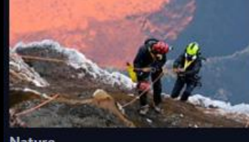
Nature Kate Humble: Into the Volcano Episode 2