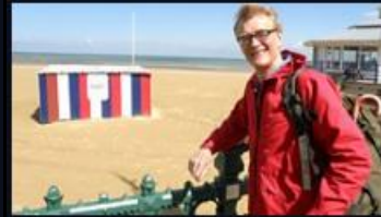
Nature Coast Series 7 Revisions: 4. The Mysteries of the Isles