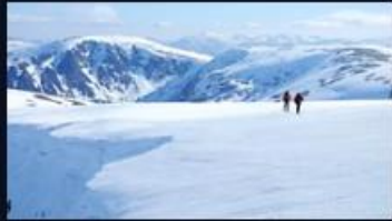
Nature A Year in the Wild 3. Cairngorms